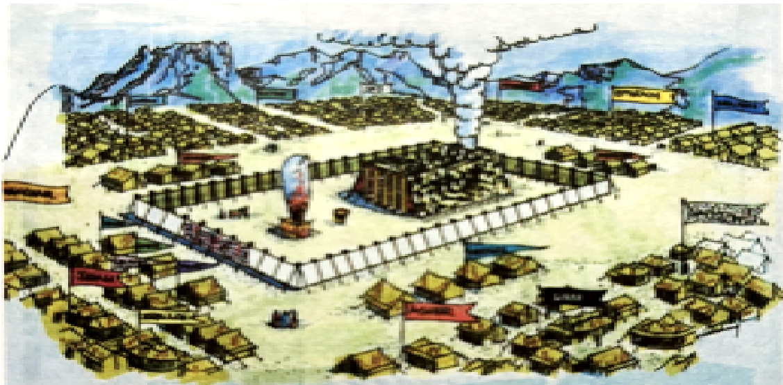
Artist's Rendering of the Campsite and the Completed Tabernacle with the Shekinah Glory Cloud

Q: Overall, what are your impressions about the Plan that God has dictated to Moses regarding the building of the Tabernacle and the Ark of the Covenant?