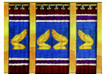
The Curtain “Veil”

The curtain will separate the Holy Place from the Most Holy Place.