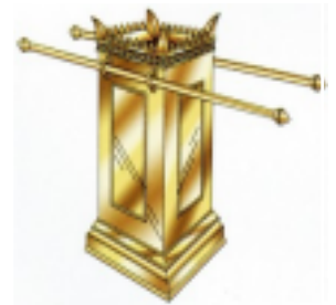
Altar of Incense

► Exodus 30:1-6 • "Make an altar of acacia wood for burning incense. It is to be square, a cubit long and a cubit wide, and two cubits high --its horns of one piece with it. Overlay the top and all the sides and the horns with pure gold, and make a gold molding around it. Make two gold rings for the altar below the molding--two on opposite sides--to hold the poles used to carry it. Make the poles of acacia wood and overlay them with gold. Put the altar in front of the curtain that is before the Ark of the Testimony--before the atonement cover that is over the Testimony--where I will meet with you.