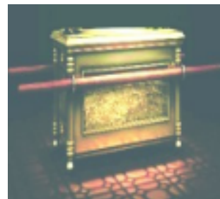
Ark of the Covenant without the mercy seat

► Exodus 25:8-16 • “Then have them make a sanctuary for Me, and I will dwell among them. Make this tabernacle and all its furnishings exactly like the pattern I will show you. Have them make a chest of acacia wood--two and a half cubits long, a cubit and a half wide, and a cubit and a half high. Overlay it with pure gold, both inside and out, and make a gold molding around it. Cast four gold rings for it and fasten them to its four feet, with two rings on one side and two rings on the other. Then make poles of acacia wood and overlay them with gold. Insert the poles into the rings on the sides of the chest to carry it. The poles are to remain in the rings of this ark; they are not to be removed . Then put in the Ark the Testimony, which I will give you.